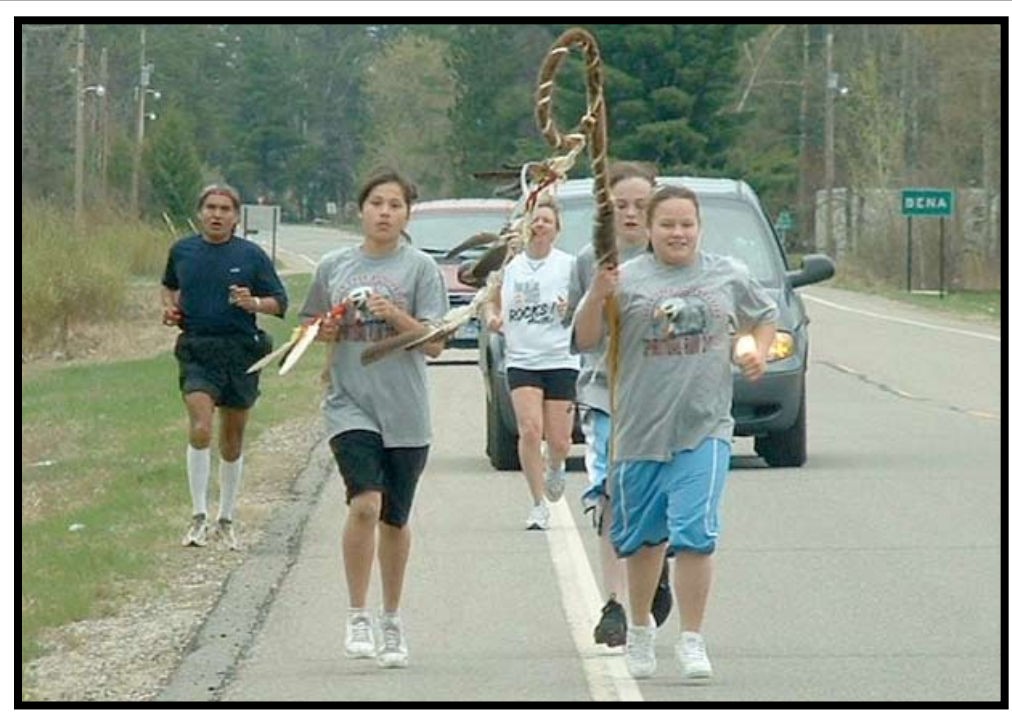
Spiritual runners as they leave the city of Bena on their way to Kego Lake.

Better plan on joining in next year. Like I said, this event is growing bigger and better with each passing year.