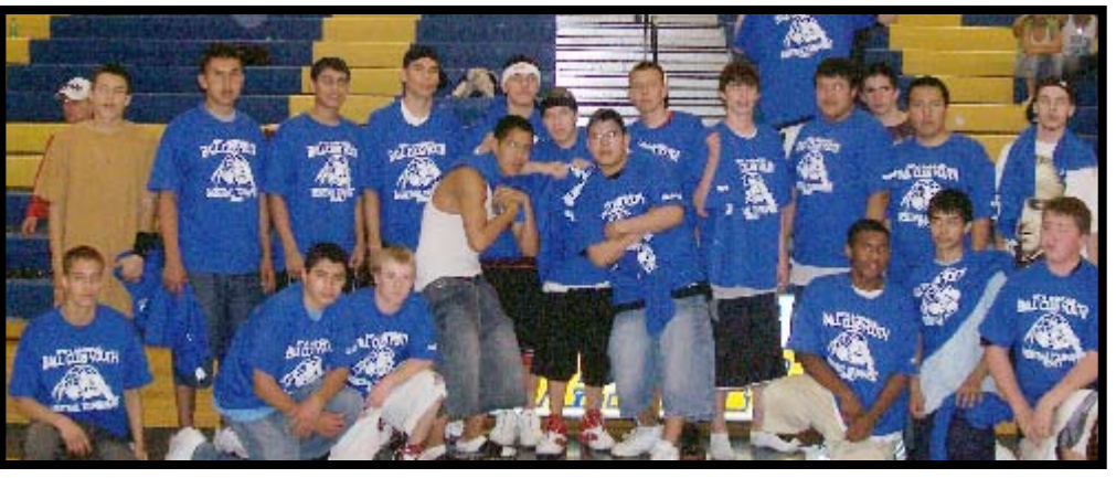
The 6th Annual Ball Club Youth basketball tournament was held on May 12th, at Deer River High School.