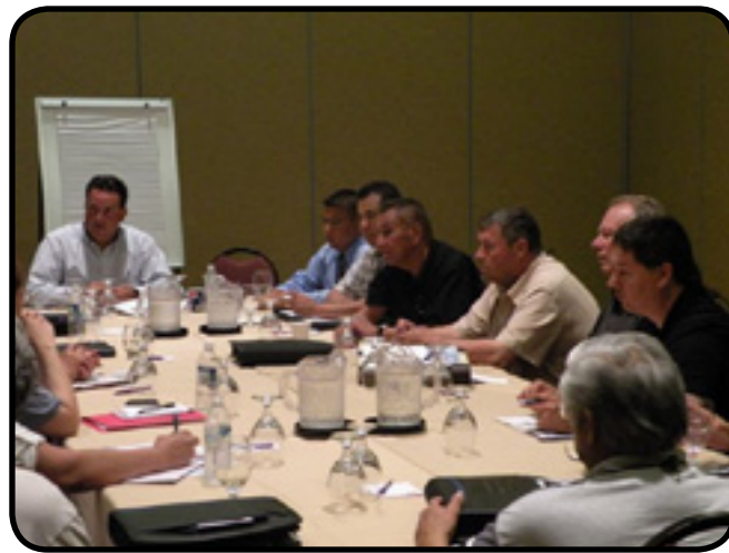
LL Admin and Executive Staff Discuss Nation Building in a break-out session.

or are we treating them as abstractions for programs and services to deal with? We need to see how we are operating our Tribal government. The quality of the questions you ask will have a direct impact on your life and those that surround you.