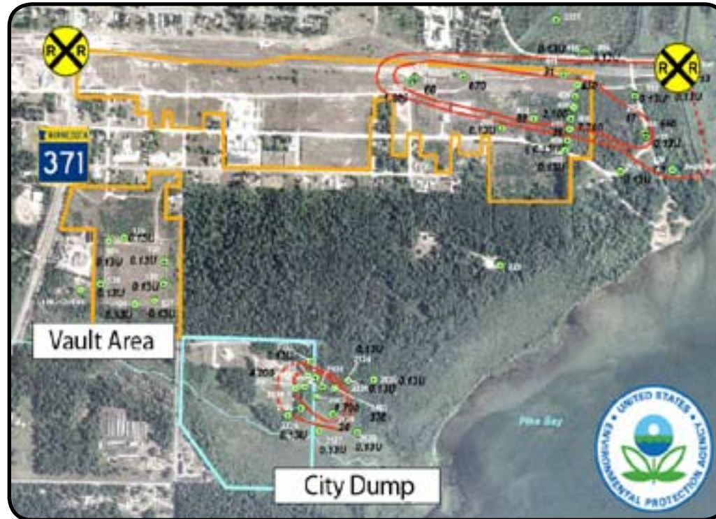
Aerial Photo showing Superfund Site Operations Area in yellow and surrounding areas.