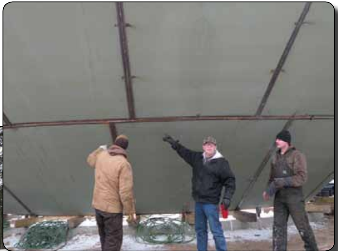
Pictures of new Water Tower Construction just down from the Palace Casino & Hotel.