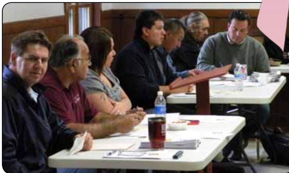
The Leech Lake Tribal Council at the Quarterly Meeting in Onigum, MN on October 9th, 2009.