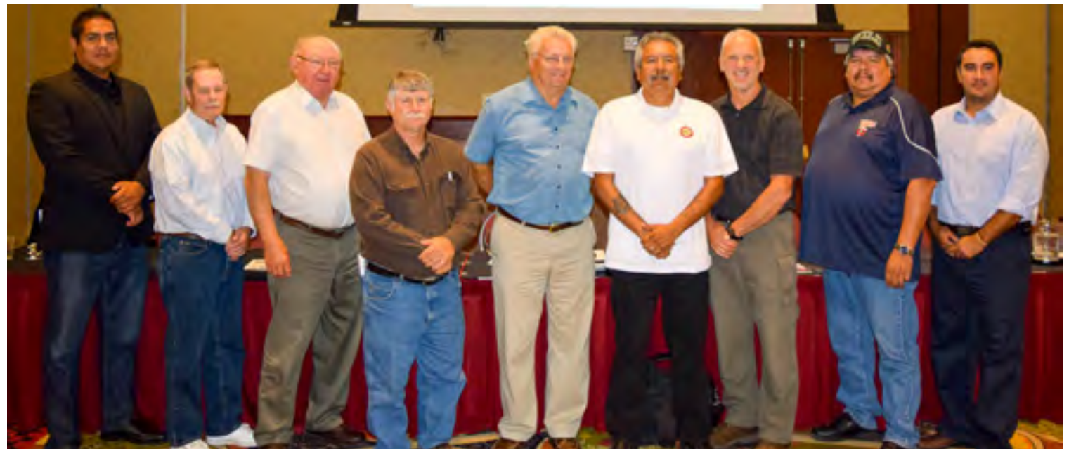
Leech Lake Tribal Council, Cass County Board of Commissioners and top administrative staff at the biannual joint meeting.