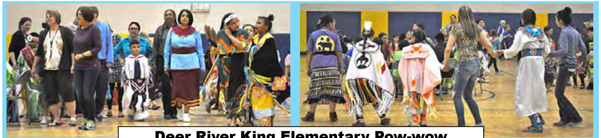
Deer River King Elementary Pow-wow