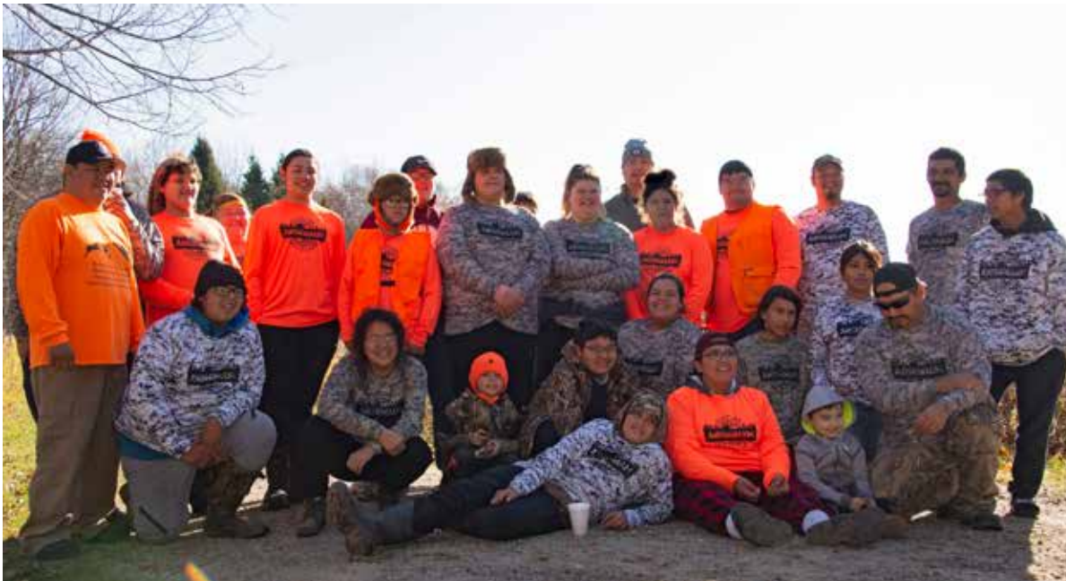
All youth and mentors of the Anishinaabe Culture Skills Camp pose for a photo on the final day.