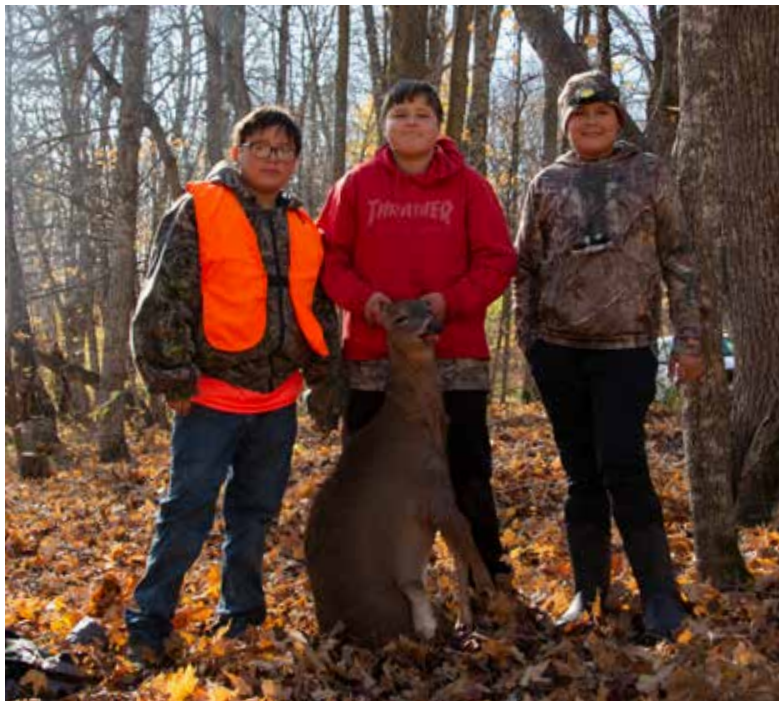
A few of the youth that attended the Skills Camp pose for a photo with their first harvested deer.

Each morning the kids woke up before light and picked which hunting activity they wanted to do – deer, waterfowl, or grouse hunting. Mentors then took their assigned youth out and taught them valuable skills on how to hunt the game of their choosing. One youth was even lucky enough to harvest their very first deer! The days would then continue with bringing in nets and learning how to clean fish followed by more hunting in the evening. When the kids were not busy hunting or