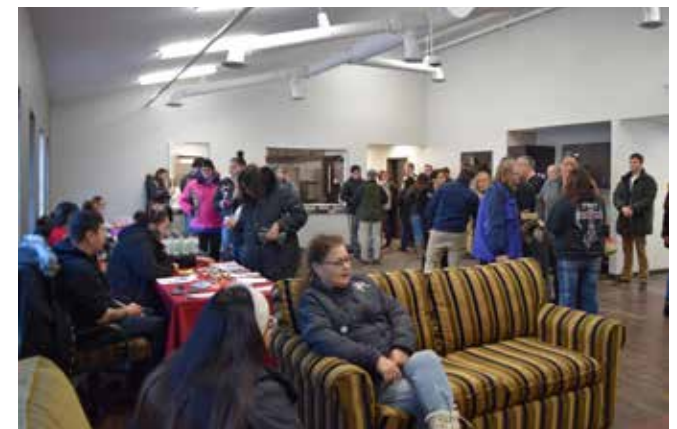
Attendees gather and take tours of the new building.