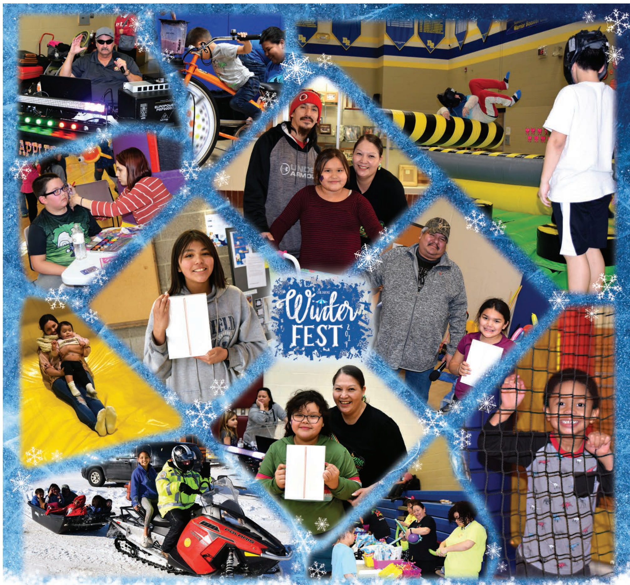
Children's Winterfest 2019 is an event facilitated by the Leech Lake Band of Ojibwe. The event takes place across the three districts of the Leech Lake Reservation. This year's Winterfest locations were District I : Deer River High School / District II : Bug O Nay Ge Shig High School / District III : Cass Lake - Bena High School. The event takes place over three days and is open to everyone.