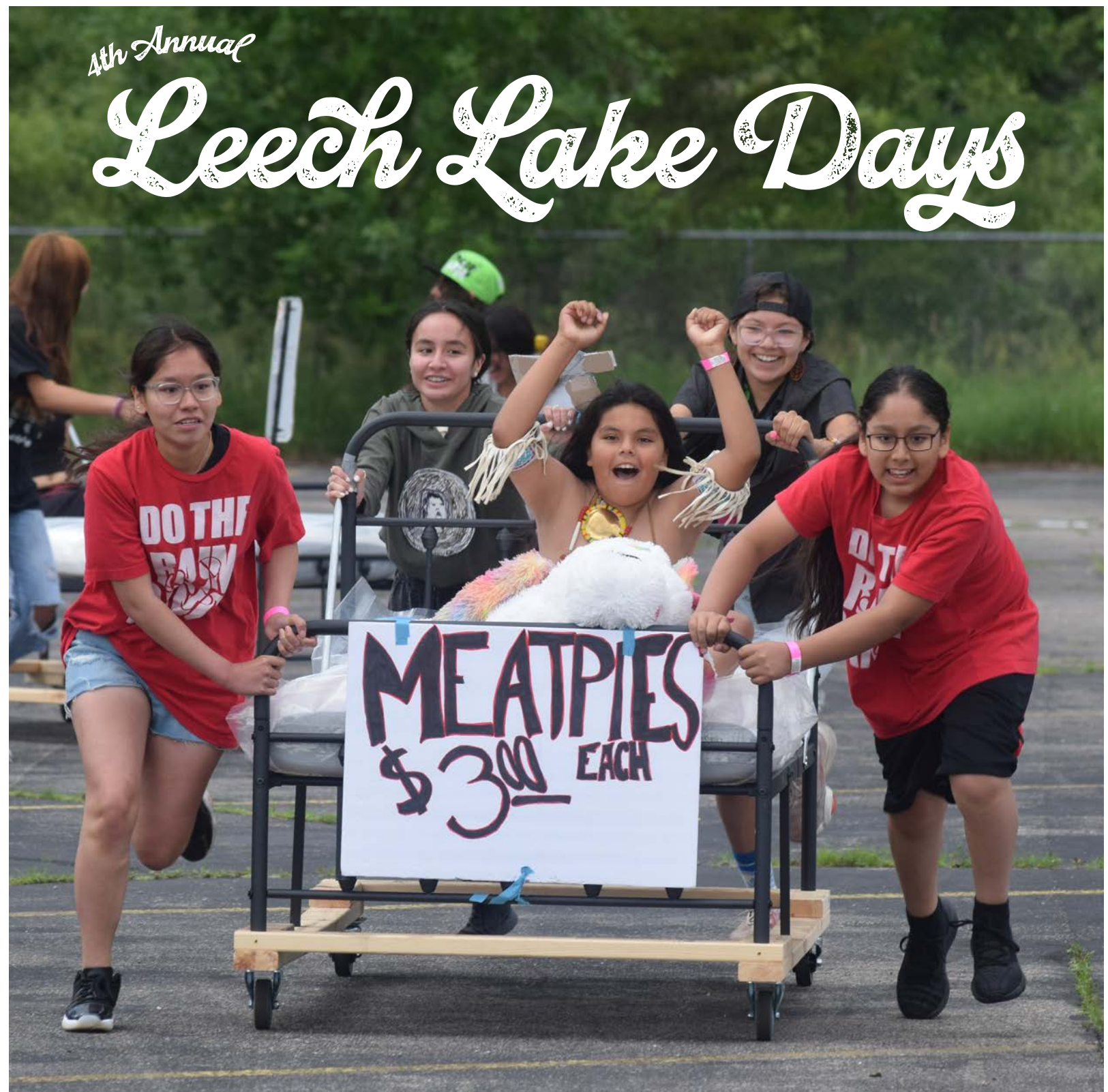
Team Reservation Bandits, winners of the Best Dressed Contest for the 2022 Leech Lake Days Bed Races. Hosted and sponsored by Leech Lake Gaming.

CASS LAKE – The Leech Lake days celebration returned to the reservation, Friday June 24.