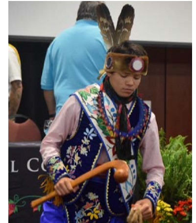
The event began with the drum group Timberland and Leech Lake dancers.