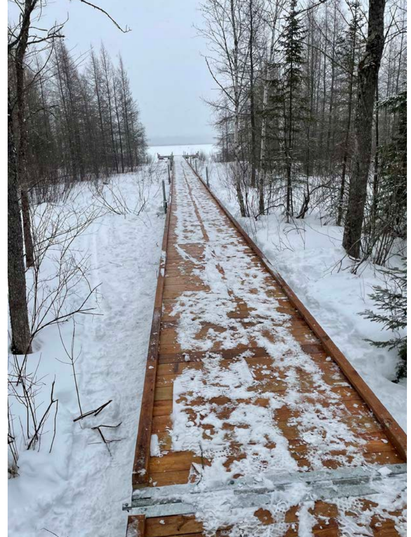
Chub Lake Boardwalk