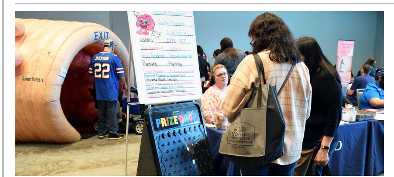
The event boasted over 30 booths providing attendees with health services, info, and check-ups.

About GreenStep: Minnesota GreenStep is a voluntary challenge, assistance, and recognition program to help cities, Tribal Nations, and schools achieve their sustainability and quality-of-life goals. This free continuous improvement program is based upon best practices that are tailored to Minnesota Reservations and communities. More at www.MnGreenStep.org.