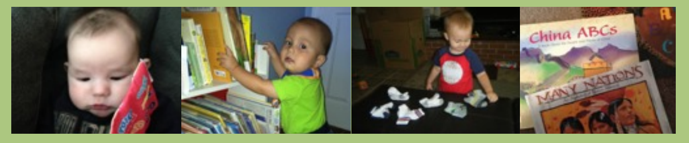
October 23, 2015 Volume 1