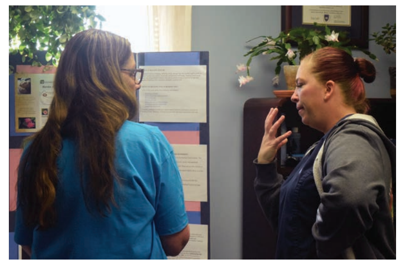
Diabetes Expo attendee discussing information provided at the "Healing Touch" booth.

Also on the schedule for the center is "Rock your Mocs" November 13 through the 15 and a meet-up on November 21 at 11am for those interested in helping organize a walk to increase diabetes awareness. The meet-up will be held at the Leech Lake Diabetes Clinic located at: 119 Aspen Avenue, Cass Lake, MN 56633