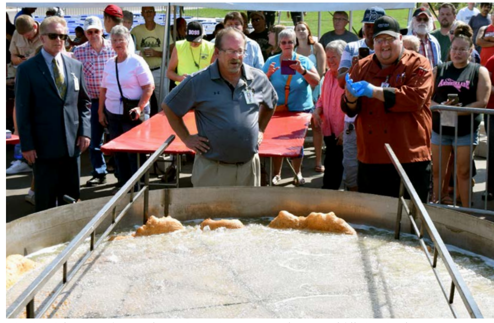
The dough begins to fry once lowered into the custom cooking vessel filled with oil.

▶ World Record Frybread continued from Page 4.