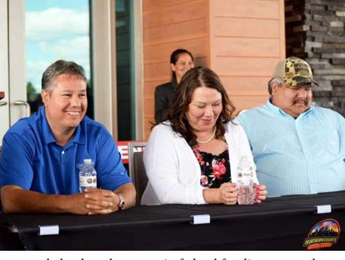
helped to close gaps in federal funding.

One example of the impact of this funding directly has been money provided for TERO worker training. The casino's construction which was ahead of schedule and under budget was completed by a construction crew that was made up of 70% Leech Lake band members and TERO employees.