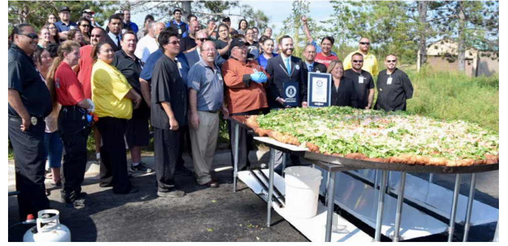
The Cedar Lakes Crew poses with the Guinness Record 150.2 lbs Frybread.