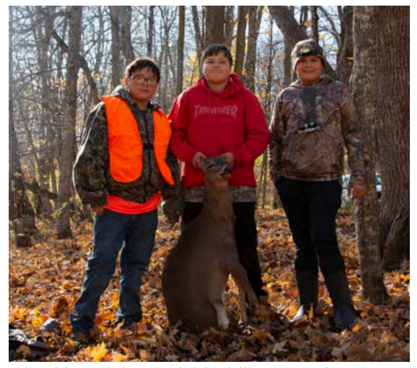
A few of the youth that attended the Skills Camp pose for a photo with their first harvested deer.

Each morning the kids woke up before light and picked which hunting activity they wanted to do – deer, waterfowl, or grouse hunting. Mentors then took their assigned youth out and taught them valuable skills on how to hunt the game of their choosing. One youth was even lucky enough to harvest their very first deer! The days would then continue with bringing in nets and learning how to clean fish followed by more hunting in the evening. When the kids were not busy hunting or