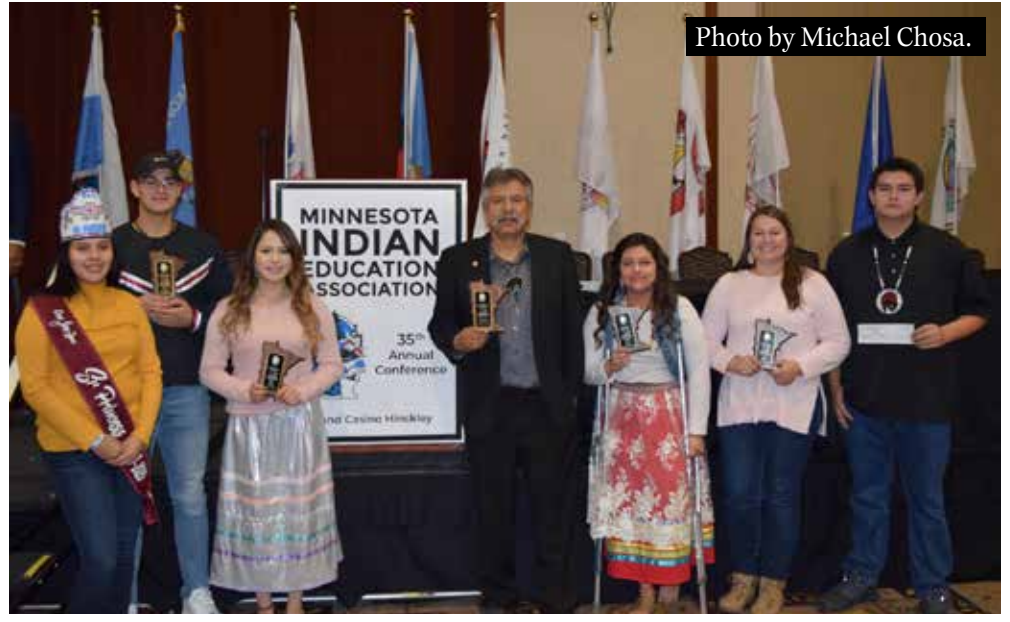
Leech Lake award recipients pose in front of the stage for a quick photo following the ceremony.