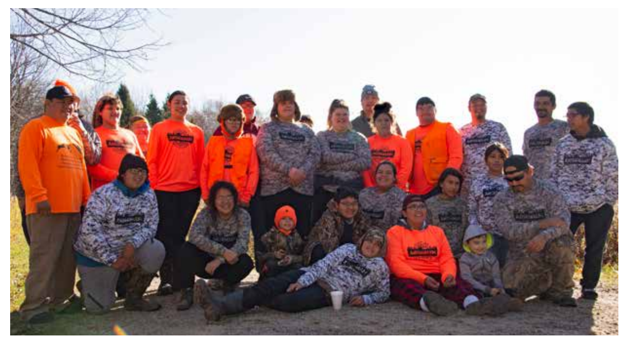
All youth and mentors of the Anshinaabe Culture Skills Camp pose for a photo on the final day.