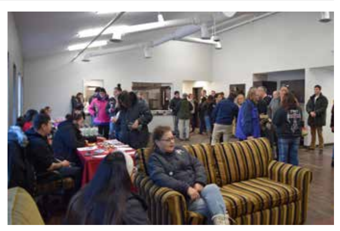
Attendees gather and take tours of the new building.