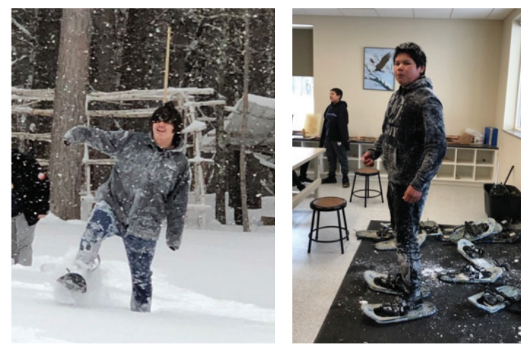
Bug O Nay Ge Shig students in the Seasonal Activities class completed an Indigenous wooden hand drill for making fires. The fly wheel component adds inertia providing friction between the soft and hard wood. When the kindling point of the soft wood is reached, it produces an ember. Students also had a chance to hone their snowshoeing skills.