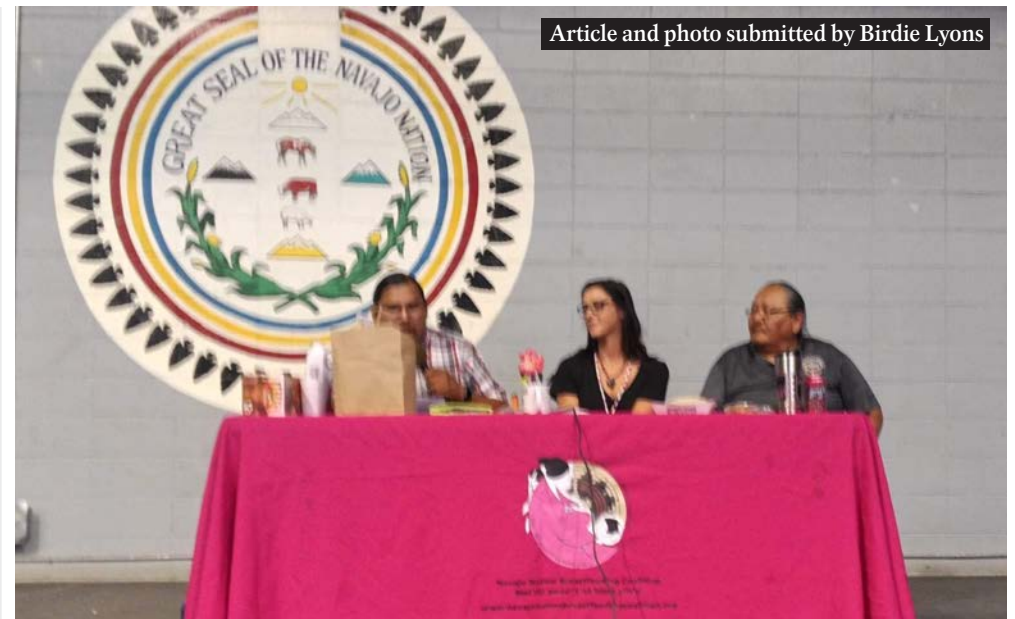
Article and photo submitted by Birdie Lyons

Some of the past trainings have included Cement Masons training, Flagger training and CDL Training. Our future trainings include Construction basics, Safety and construction worksites and a variety of other related trainings. If you're interested in TERO related trainings, contact Marilyn Wind, TERO Compliance and Training Officer at Marilyn.wind@llojibwe.org