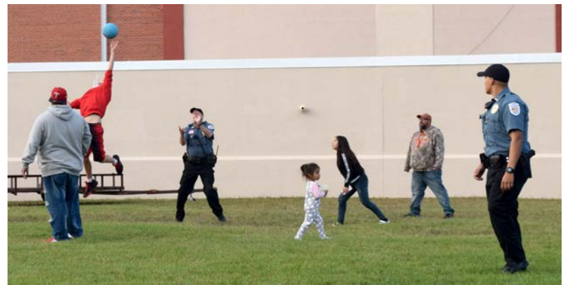
Club members face the Leech Lake Tribal Police in a game of kickball.