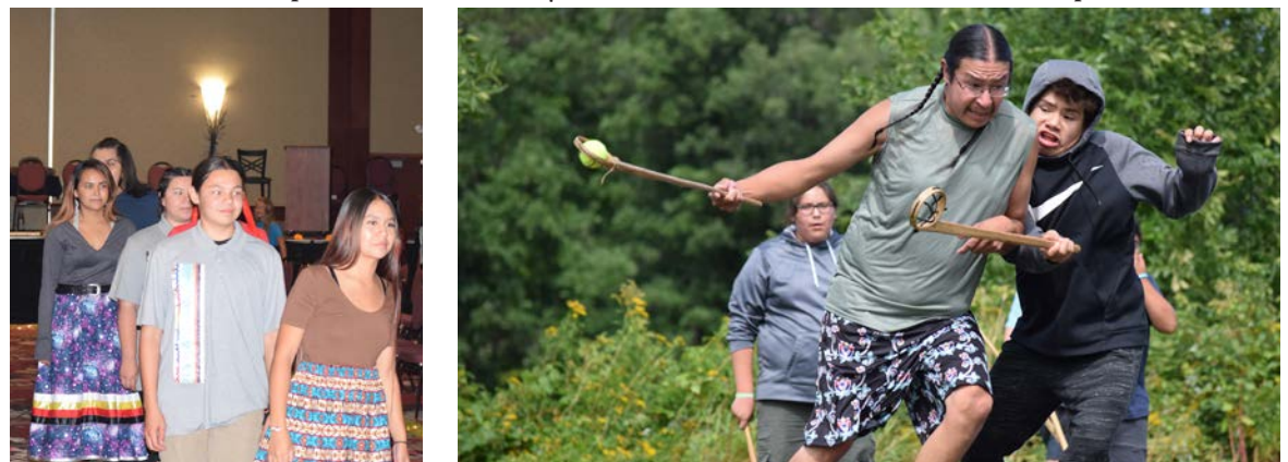
Pictured left to right : Youth show off their indigenous style in the Ojibwe Fashion Show. Youth Summit attendees enjoy a match of traditional Lacrosse.