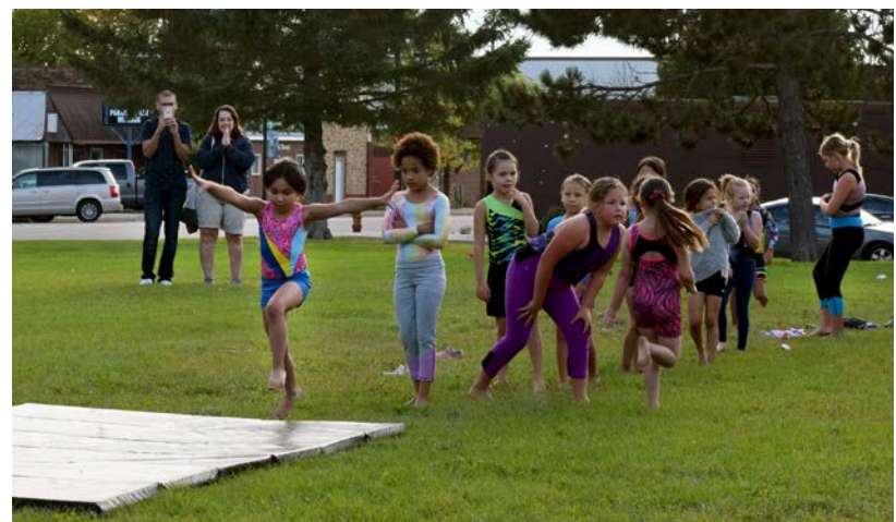
Attendees cheer on the Northern Dream Gymnastic Performance.