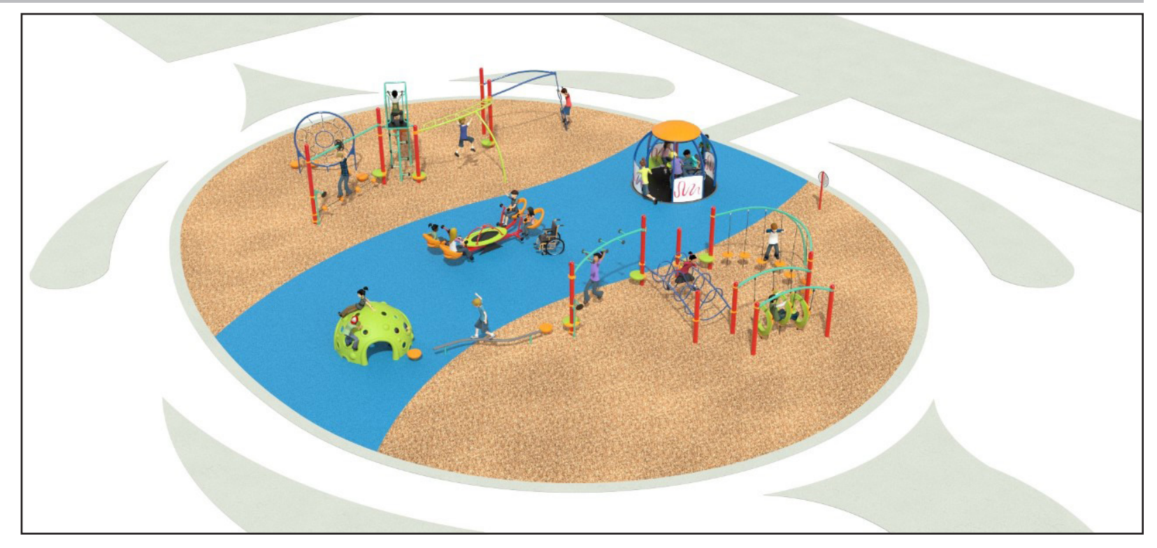
Above Photo: The ribbon of "Poured in Place" surface being installed at the Ball Club Park meanders like a river through the center of the playground, and brings accessibility into the heart of play. Construction of the playground is scheduled to wrap up in late September, completing a three-year community-driven project.