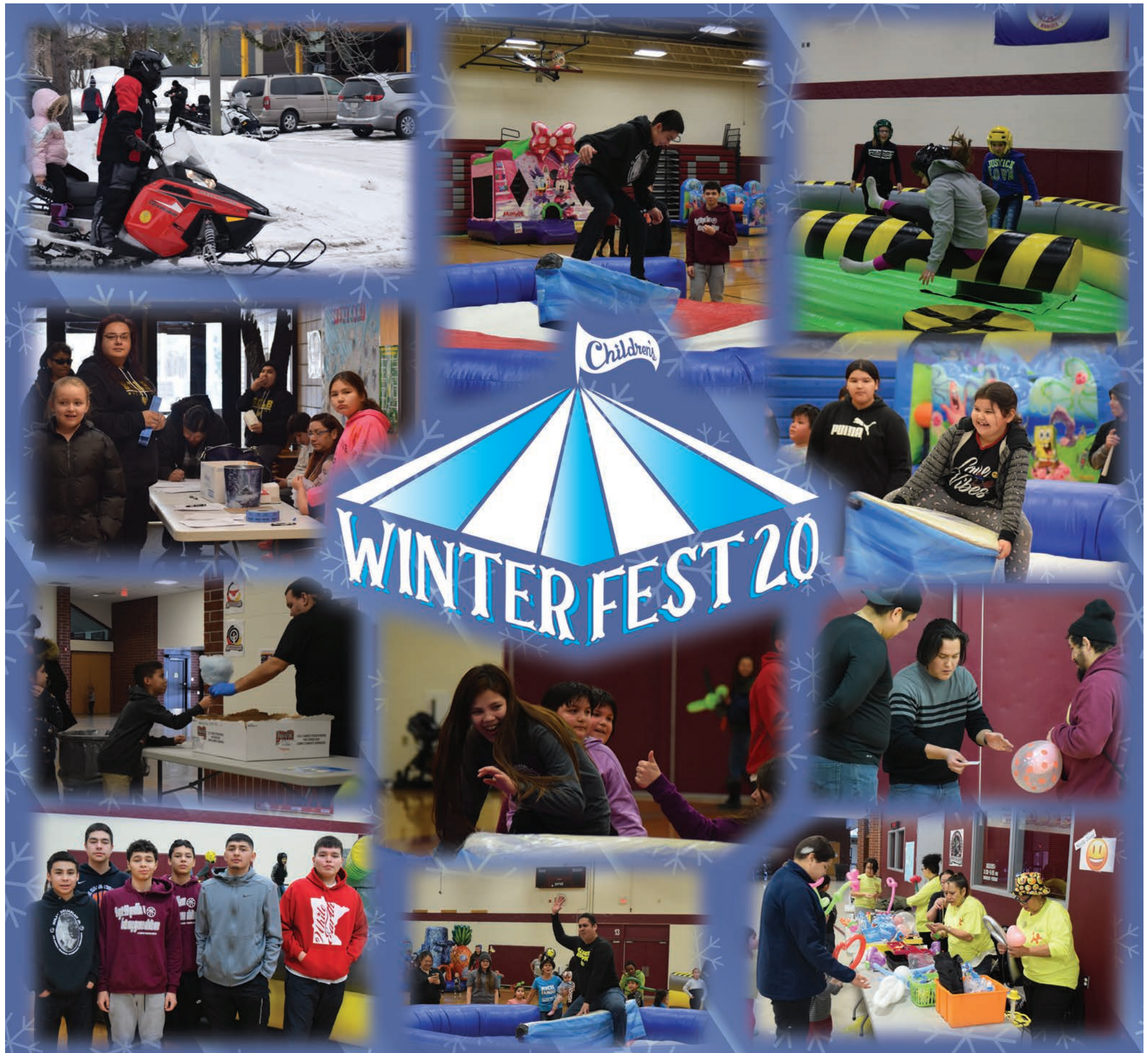
Children's Winterfest 2020 is an event facilitated by the Leech Lake Band of Ojibwe. The event takes place across the three districts of the Leech Lake Reservation. This year's Winterfest locations were District I : Deer River High School / District II : Bug O Nay Ge Shig School / District III : Cass Lake - Bena High School. The event takes place over three days and is open to everyone. See you in 2021, miigwech!