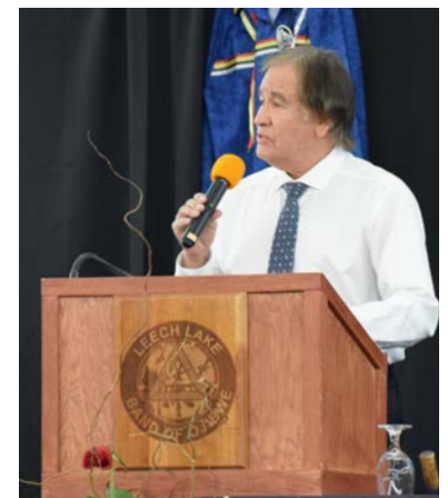
Guest Speaker Billy Mills.