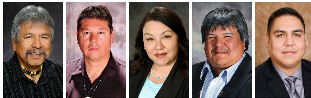
Leech Lake Band of Ojibwe