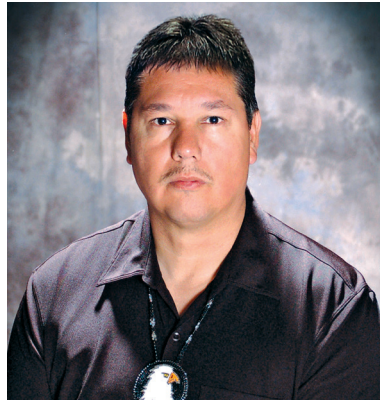
Governmental Activities Secretary/Treasurer's Summary Remarks delivered at the Quarterly Meeting on Friday April 9, 2021

Boozhoo. The financial position of the Band as of this quarter ending March 31, 2021, remains strong and steady. We began the fiscal year with a positive (Surplus) fund balance of $19 million and with daily monitoring of our budgets and spending, we are estimating ending the fiscal year with a similar surplus. The Band's Budget Ordinance requires that we establish an emergency reserve and we have been maintaining that reserve fund balance for large scale emergencies such as the federal government shut down in 2019 that affected federal grant draw-down funding. The COVID-19 Pandemic also dramatically affected our cash flow, most noticeable on the Gaming side since we had to shut down the casino operations for over three months for public safety reasons. Both of these incidents could have put the band in a severe cash-flow situation, however, with the surplus reserves in place we were ready and able to continue operations.