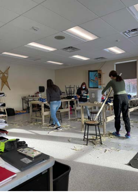
Bug O Nay Ge Shig students in the Seasonal Activities class have begun working on their snowsnake projects. So far, they have collected the popple poles, peeled them, and sanded them. Next they will paint and varnish them. Think snow!