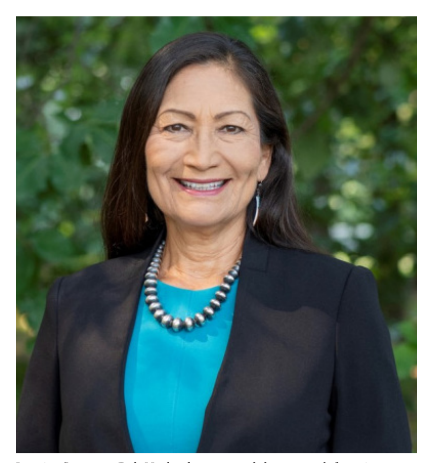
Interior Secretary Deb Haaland announced the new task force in a press conference November 19.