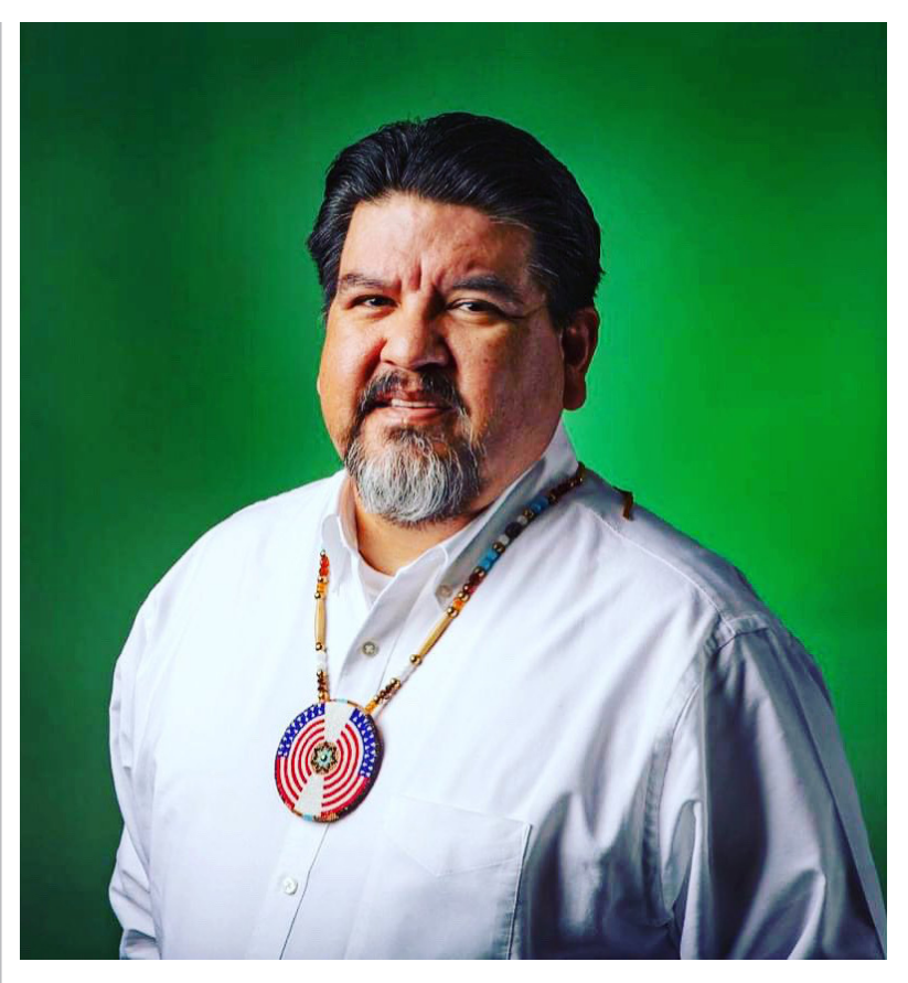
Newly appointed National Park Service Director, Charles Sams III.

Several states have passed legislation prohibiting the use of the word "squ*w" in place names, including Montana, Oregon, Maine, and Minnesota. There is also legislation pending in both chambers of Congress to address derogatory names on geographic features on public land units.