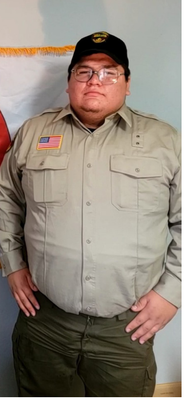
Meet the New Conservation Officer

Miigwech to all our current and previous staff that made this exertion of Tribal sovereignty possible!