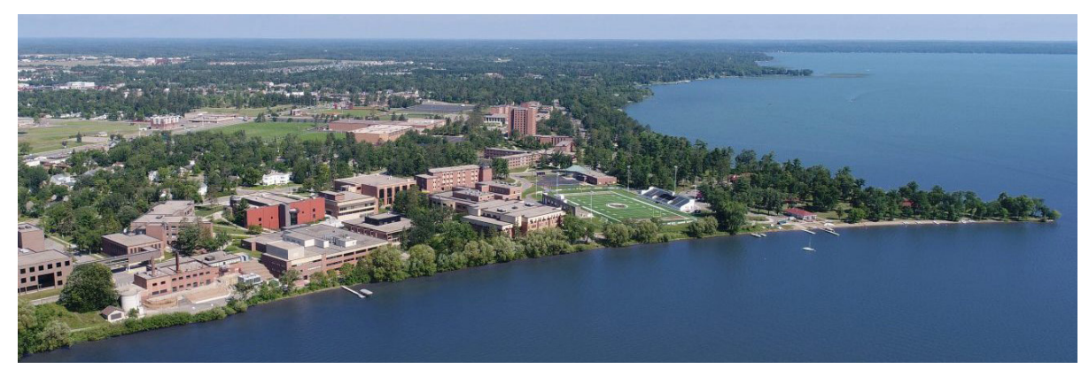
The Bemidji State Campus sits along the shores of Lake Bemidji.