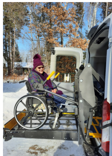
Some of the purchases the LLBO Health Division were able to make include: Handicap friendly transportation, a mobile clinic and vaccination trailers, as shown in the photos above.