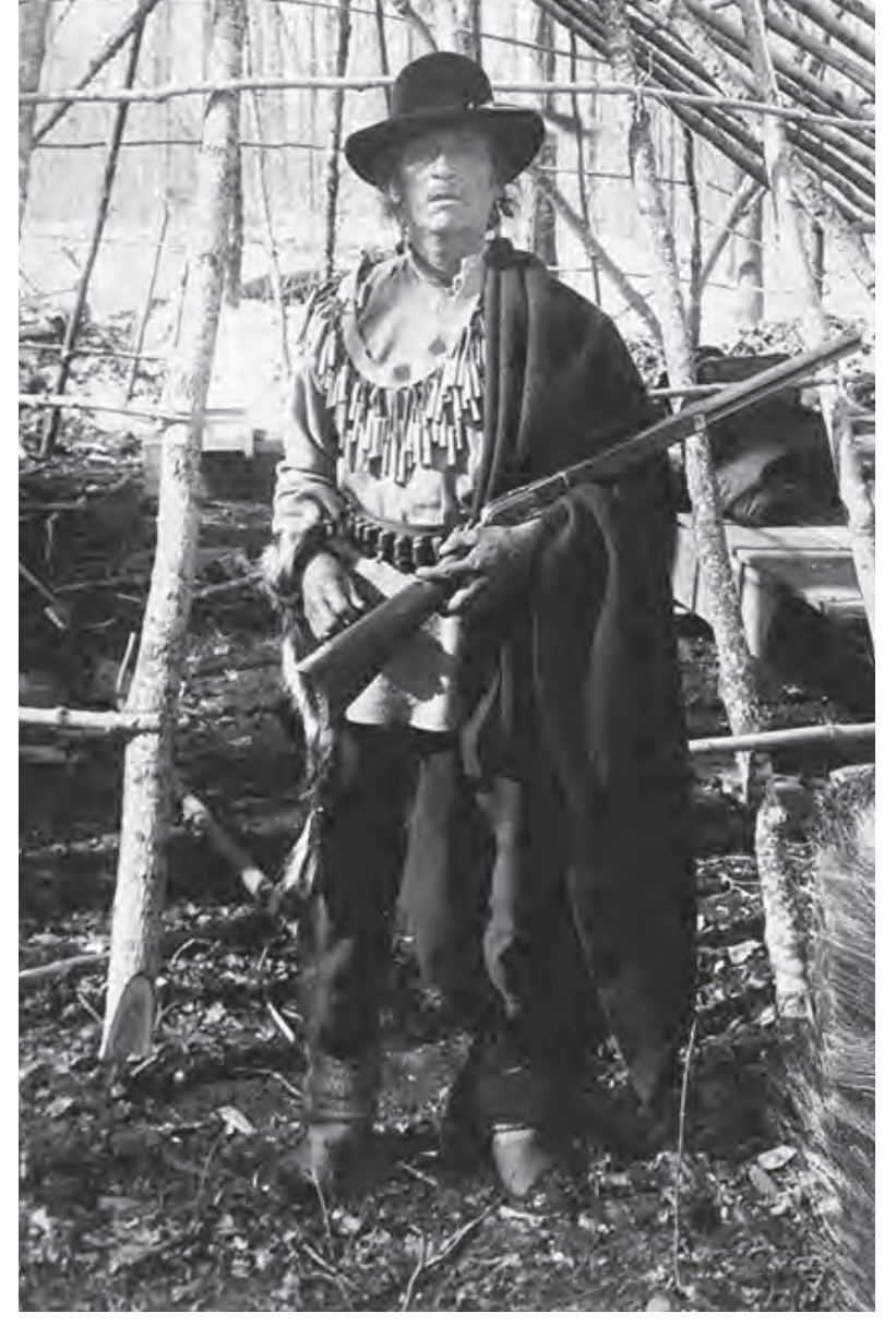
"Old Bug" Bug-O-Nay-Ge-Shig.

None of the Pillager Ogichidaa who engaged in battle at Sugar Point ever were tried or received punishment for their involvement. Bug-O-Nay-Ge-Shig went on to live another 18 years in the area before passing peacefully. The U.S. Army never returned to the shores of Sugar Point on Leech Lake, the site of their final battle and defeat in the period now known as the "Indian Wars".