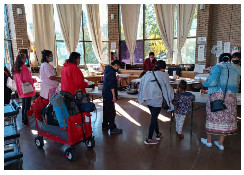
Bug O Nay Ge Shig School held its first school/community Feast and Pow wow on Friday afternoon 9/24 at the school. The weather was beautiful and a large crowd of visitors, students and staff enjoyed the outdoor celebration.