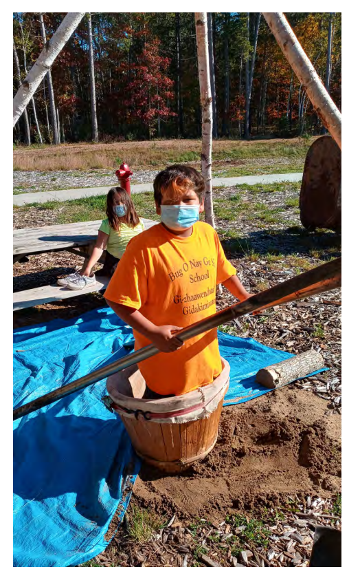
Aabinoojiinh, jigging (thrashing) the rice.