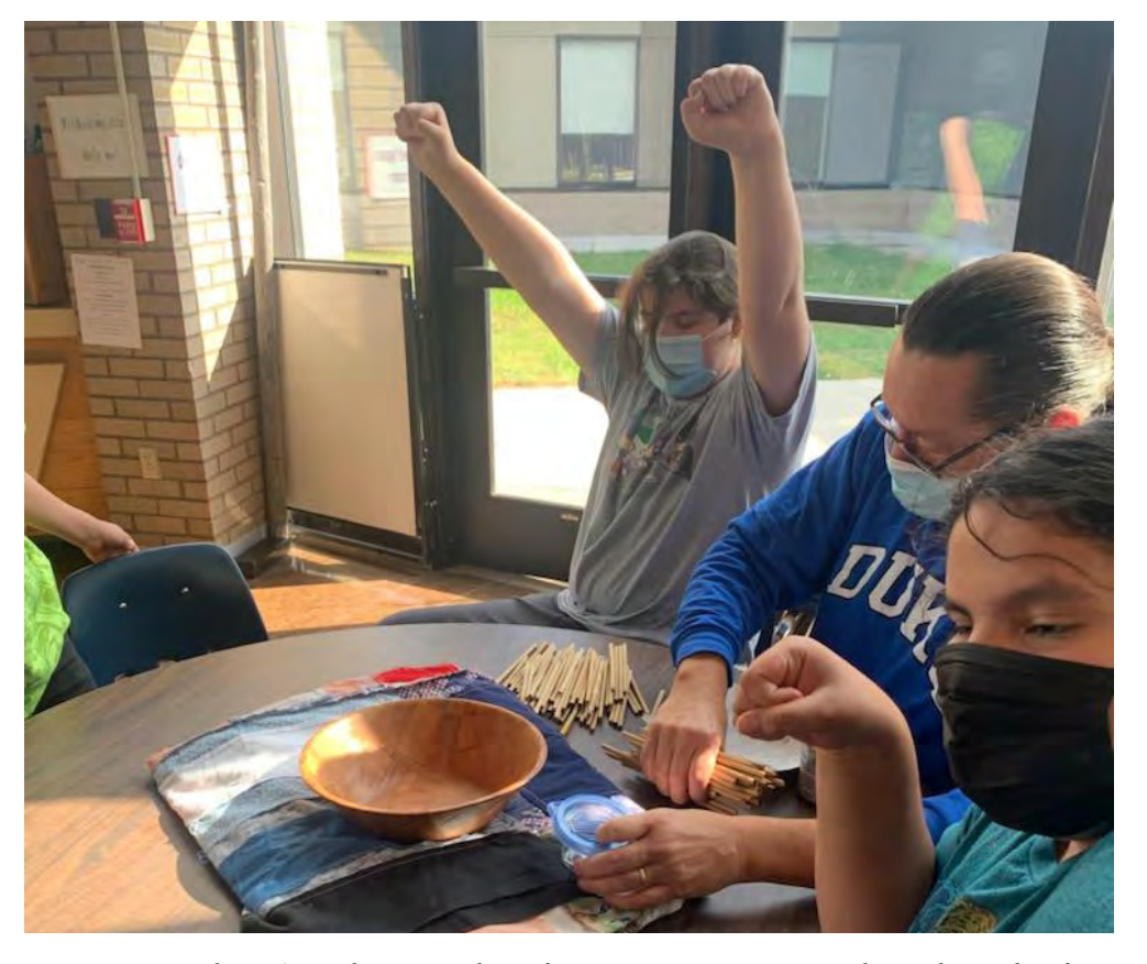
Bug O Nay Ge Shig 6<sup>th</sup> Grader, Leon, shows his excitement at winning the traditional Ojibwe Bagese Dish Game which involves intricate counting of carved bone figures as they land into a dish. Bagese ataadiwin agindaasowin.

They also toured the camp and equipment. Before returning to school, everyone enjoyed a dance with the drum.