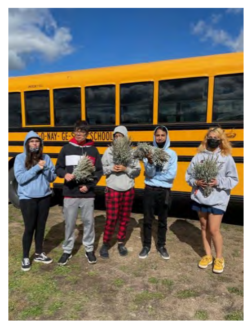
Bug O Nay Ge Shig High School seniors enjoyed a sunny day visiting Camp Ripley last week. The students were able to pick sage, eat, and practice archery with the soldiers.

They also toured the camp and equipment. Before returning to school, everyone enjoyed a dance with the drum.