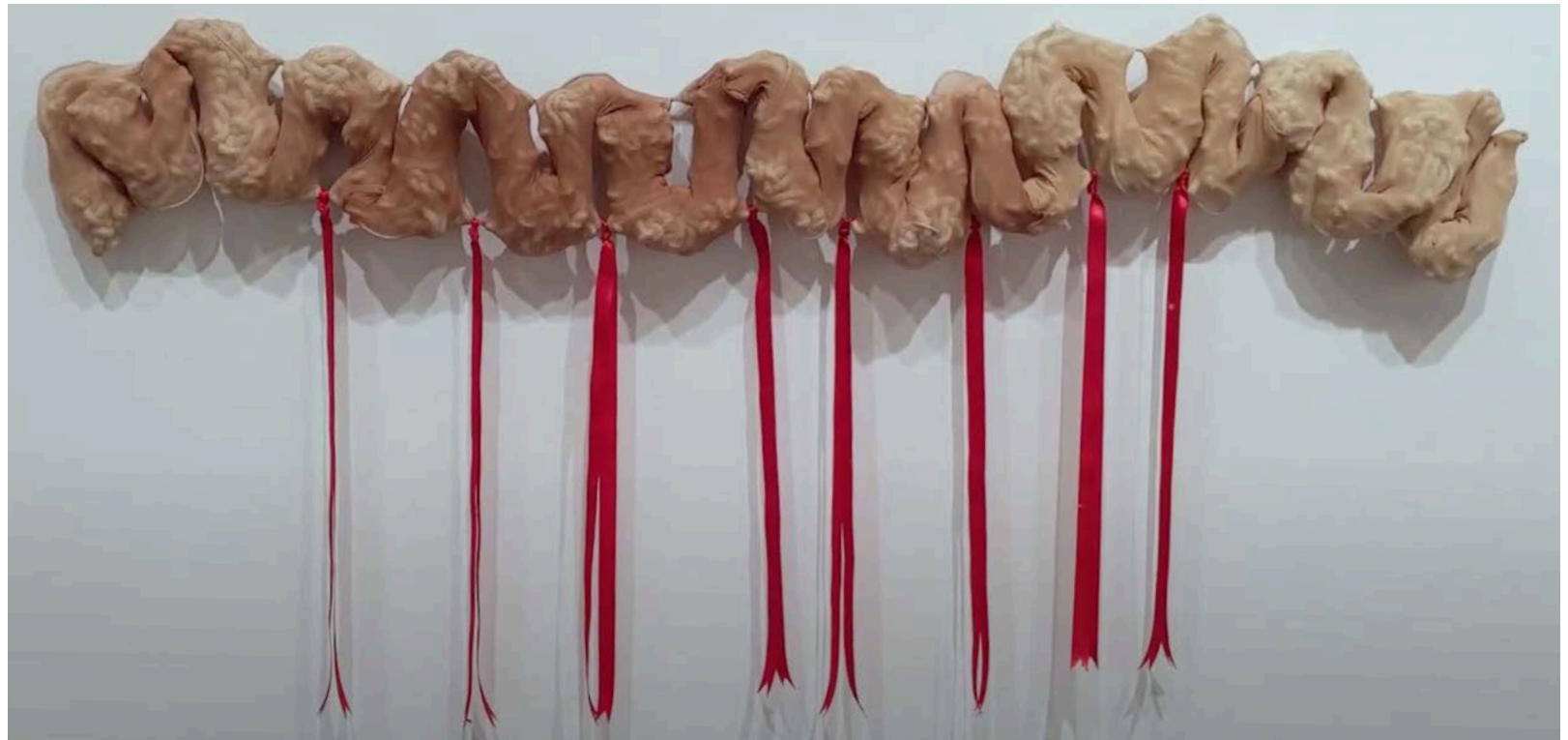
Above Photo: "The Equivocator Series 2," assembled with rope, stockings, wire, thread and ribbon. Middle Photo Below: "Crisis," latex and beads.

BEMIDJI – The Bemidji Watermark Art Center has a new exhibit in the Miikinaan gallery.