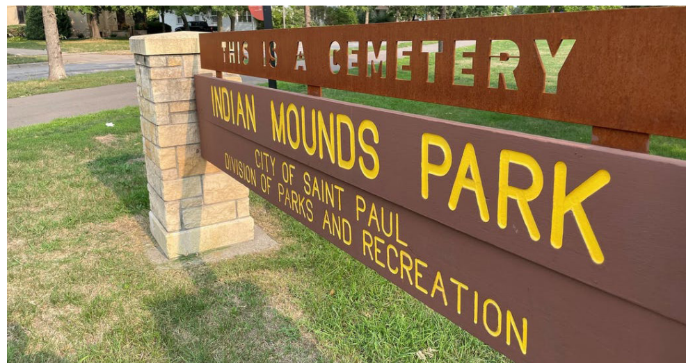
New signage has been added at the park entrance and throughout on existing posts.