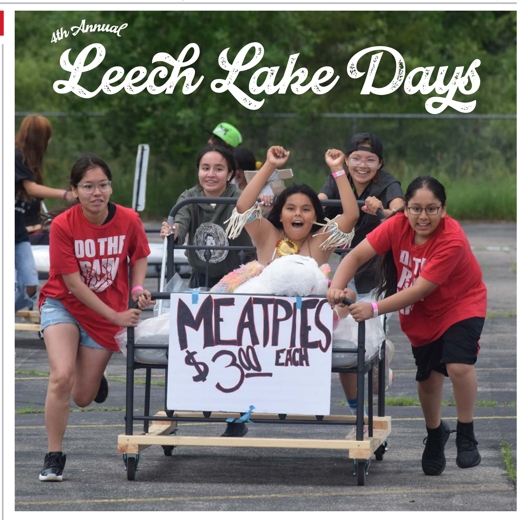
Team Reservation Bandits, winners of the Best Dressed Contest for the 2022 Leech Lake Days Bed Races. Hosted and sponsored by Leech Lake Gaming.

CASS LAKE – The Leech Lake days celebration returned to the reservation, Friday