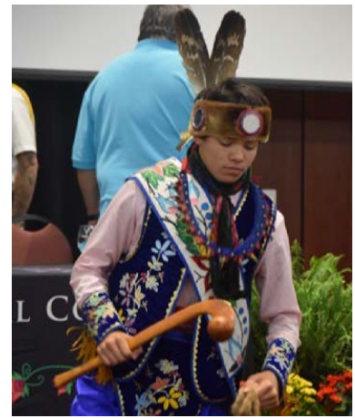
The event began with the drum group Timberland and Leech Lake dancers.