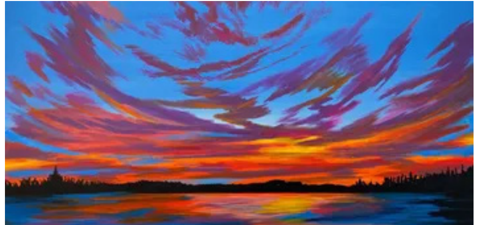
"Summer Sunset No. 1," by Kent Estey.