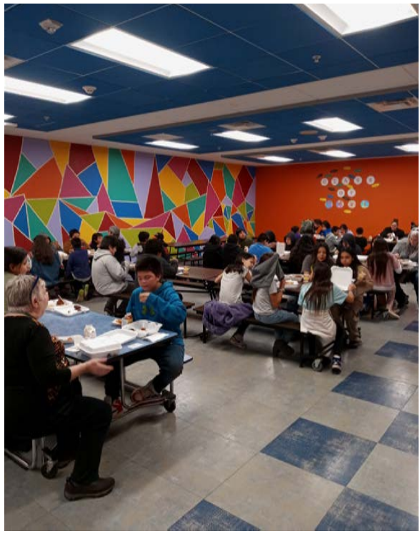
▲ Bug O Nay Ge Shig students enjoyed an early Thanksgiving Feast thanks to a lot of hard work by the kitchen crew. All of the traditional foods were served including pumpkin pie.