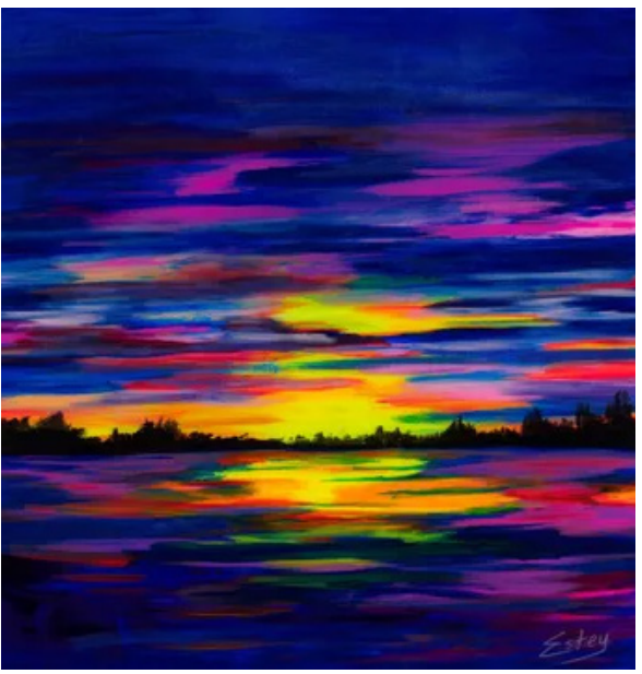
"Remember Summer No. 2," by Kent Estey.