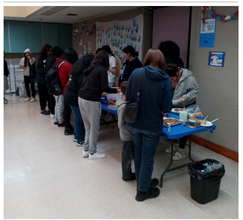
▲ Veterans were honored at Bug O Nay Ge Shig School on November 9, with a Feast and gift. The food was prepared by the school's staff, especially the cultural staff and included walleye, wild rice, fry bread and many side dishes and desserts. The Student Council helped with serving and clean-up.