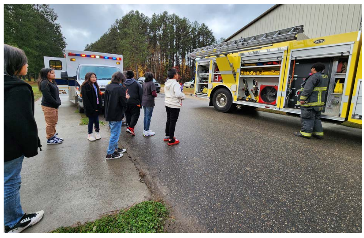
▲ Bug O Nay Ge Shig Elementary students enjoyed a presentation and tour of emergency vehicles. We had vehicles from the Leech Lake Tribal Police (car and truck), and the Cass Lake ambulance and firetruck. Miigwech to all of our public servants.