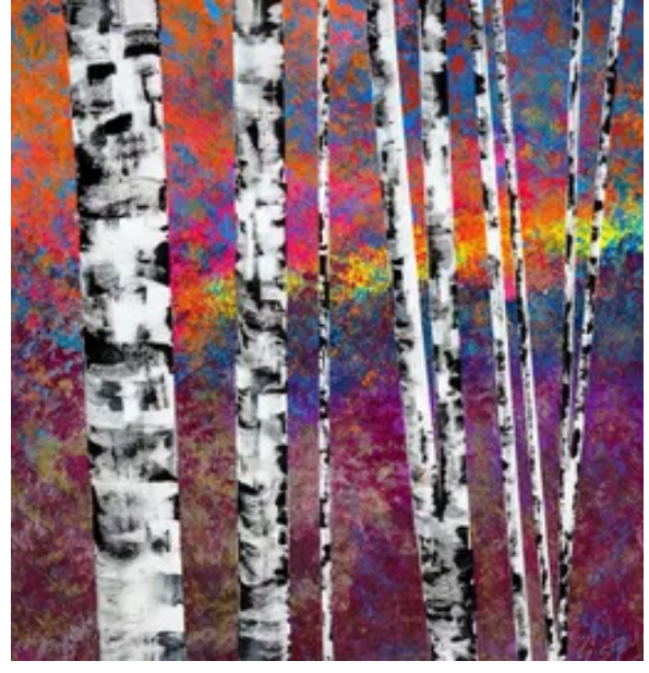
"Wiigwaas - Birches No. 1," by Kent Estey.