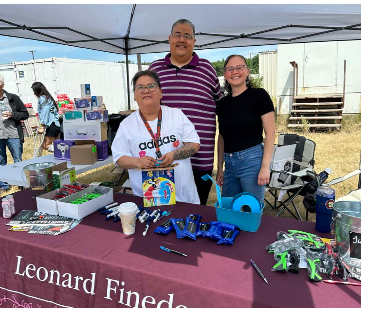
via SECRETARY TREASURER'S OFFICE

The LLBO is slowing moving forward with the implementation of our expanded jurisdiction to regulate Class II Gaming throughout the boundaries of the Reservation. Even though I have reported on this expended jurisdiction for several months, implementation is intentionally going slow as it is uncharted territory for both our gaming regulators and our gaming management. In June, the RBC approved the first Class II License for a non-Band owned facility in compliance with our Amended Gaming Ordinance and NIGC regulations. We will continue the roll out of this expanded jurisdiction slowly to ensure we are doing things cor-