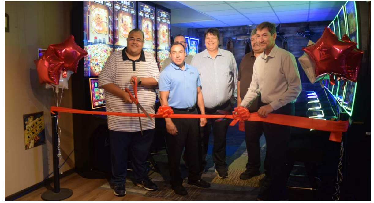
Ribbon cutting at the Big Winnie Bar in Bena, MN, showcasing the new Class 2 slot machines.

The new Bemidji clinic is located at 136 Peaceful Meadow LN, SE, Bemidji, MN 56601, and is open M-F 8am-4:30pm.