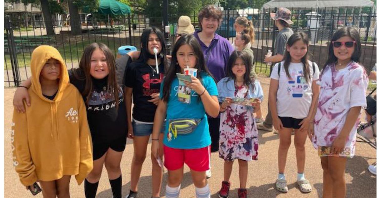
▲ During Summer School at Bug O Nay Ge Shig students had taken part in fun educational activities at school as well as field trips to Itasca State Park and the Forest Center. Concluding this years Summer School students were treated to a field trip to the Science Museum of MN and the Como Zoo. The enjoyable trip lasted all day as both are located in St. Paul.