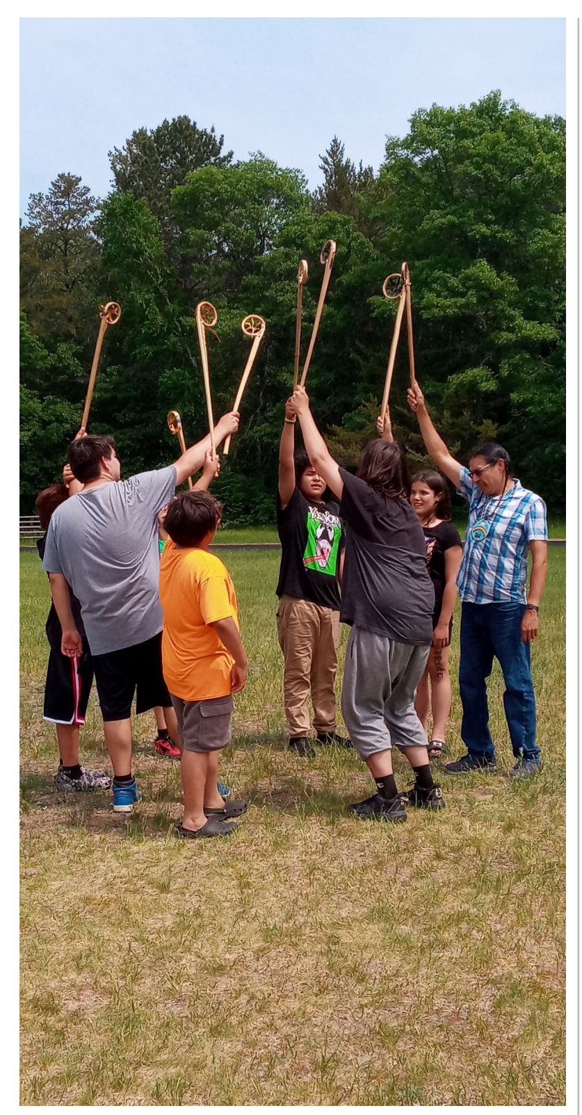
▲ Bug O Nay Ge Shig School's Culture Camp last week included Ojibwe language, traditional games, birchbark construction, beadwork, knife safety, and plenty of fun activities.

15353 Silver Eagle Drive, Bena, MN 56626 | Phone: 218-665-3000 Toll Free: 1-800-265-5576 | www.bugonaygeshig.org