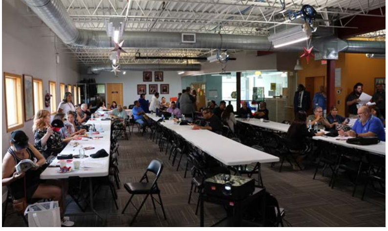
LLBO Twin Cities Office.

tions for either dorms or the family room area. As of 6/15/2023 the program has taken in 85 single individuals in both the men and women's dorm. In the family room area, we have had 2 families apply for a room.