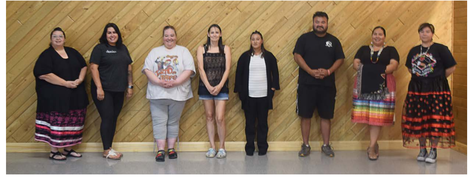
Honorees at the annual Graduation Celebration held at Morse Town Hall, Deer River.