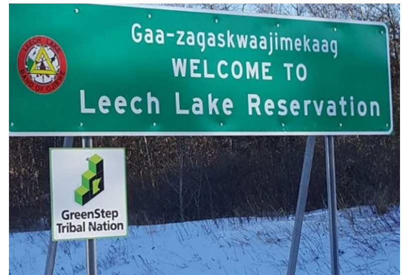
GreenStep Tribal Nation sign entering Leech Lake Reservation.