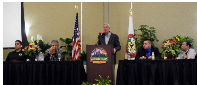
Former U.S. Representative Rick Nolan addresses those in attendance.