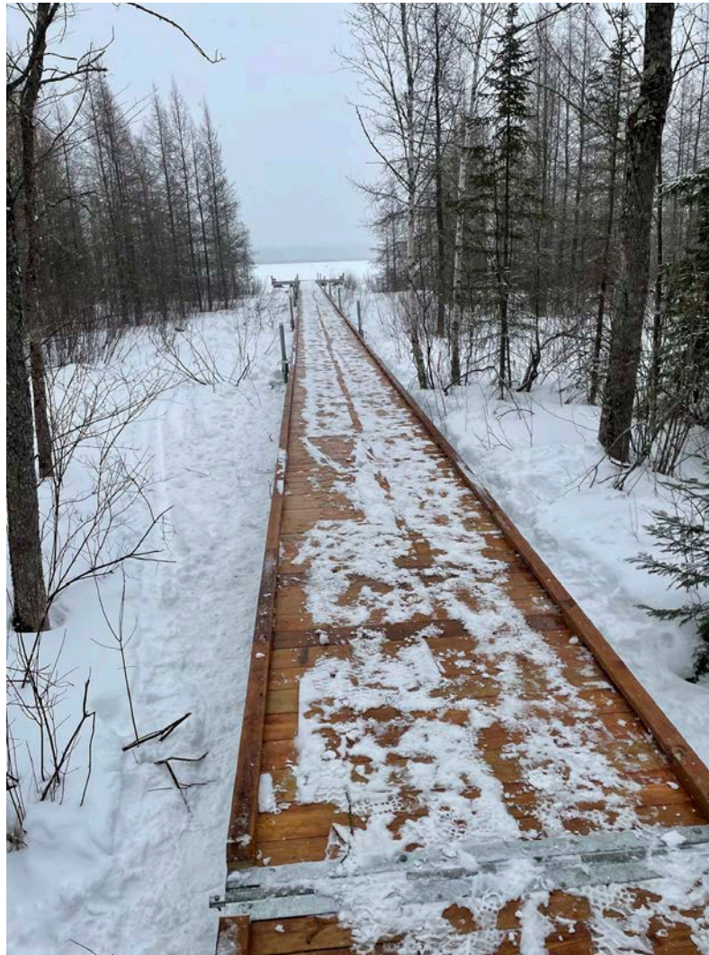
Chub Lake Boardwalk.