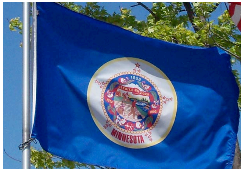
The current Minnesota State Flag.