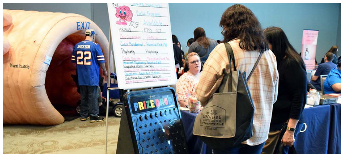
The event boasted over 30 booths providing attendees with health services, info, and check-ups.

About GreenStep: Minnesota GreenStep is a voluntary challenge, assistance, and recognition program to help cities, Tribal Nations, and schools achieve their sustainability and quality-of-life goals. This free continuous improvement program is based upon best practices that are tailored to Minnesota Reservations and communities. More at www.MnGreenStep.org .