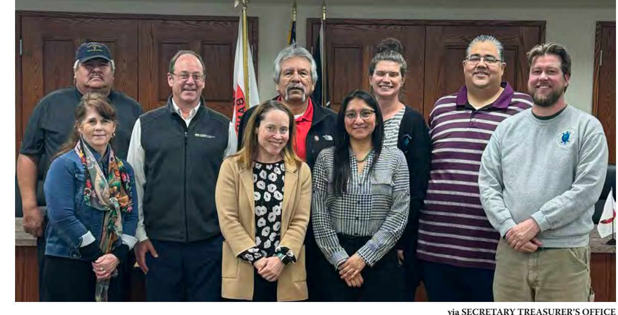
Leech Lake RBC and staff met with Katrina Kessler, Commissioner of the Minnesota Pollution Control Agency and other Agency staff on March 18, 2024 in the RBC Chambers. Discussion centered around the new sulfate standards that aim to protect Minnesota's wild rice beds.

For the first and second quarters of FY24, the total revenue for the Special Revenue Fund was $41,799,075, reflecting an increase of $14,209,488 over the same period last year, for a year over year increase of 51.5%. Total Special Revenue Fund expenditures for the period were $42,654,903, reflecting a decrease of $5,449,557 over the same period last year, for a year