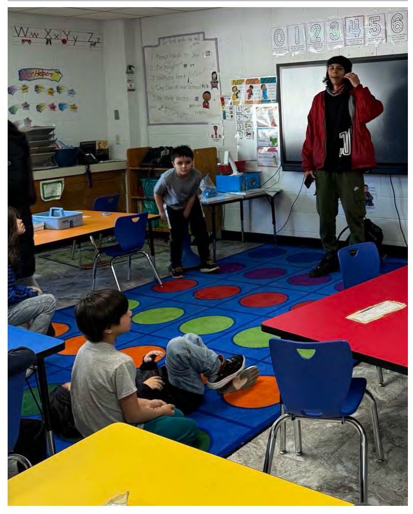
▲ Seasonal Activities classes at Bug O Nay Ge Shig finished a unit on storytelling by telling a legend to one of the elementary classes.