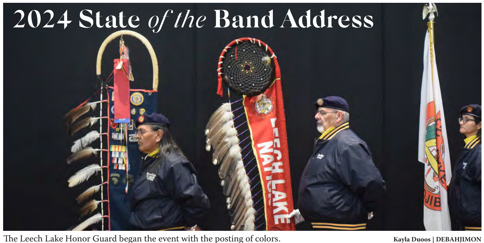
The Leech Lake Honor Guard began the event with the posting of colors.