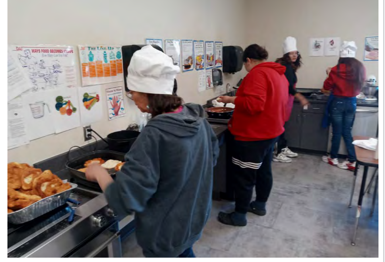
▲ The Bug O Nay Ge Shig Student Council recently had a fundraiser for the Round Dance which they are sponsoring at the school on March 22. Their Fry Bread Taco Sale at the Facility Center netted a profit of a little over $1,000. Miigwech to all who helped.

15353 Silver Eagle Drive, Bena, MN 56626 | Phone: 218-665-3000 Toll Free: 1-800-265-5576 | www.bugonaygeshig.org