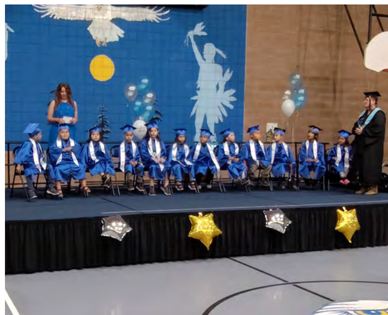
▲ The Bug O Nay Ge Shig Class of 2036 celebrated their Kindergarten Graduation on May 30 with family and friends. The event included a music performance, speakers, diplomas, gifts and refreshments.