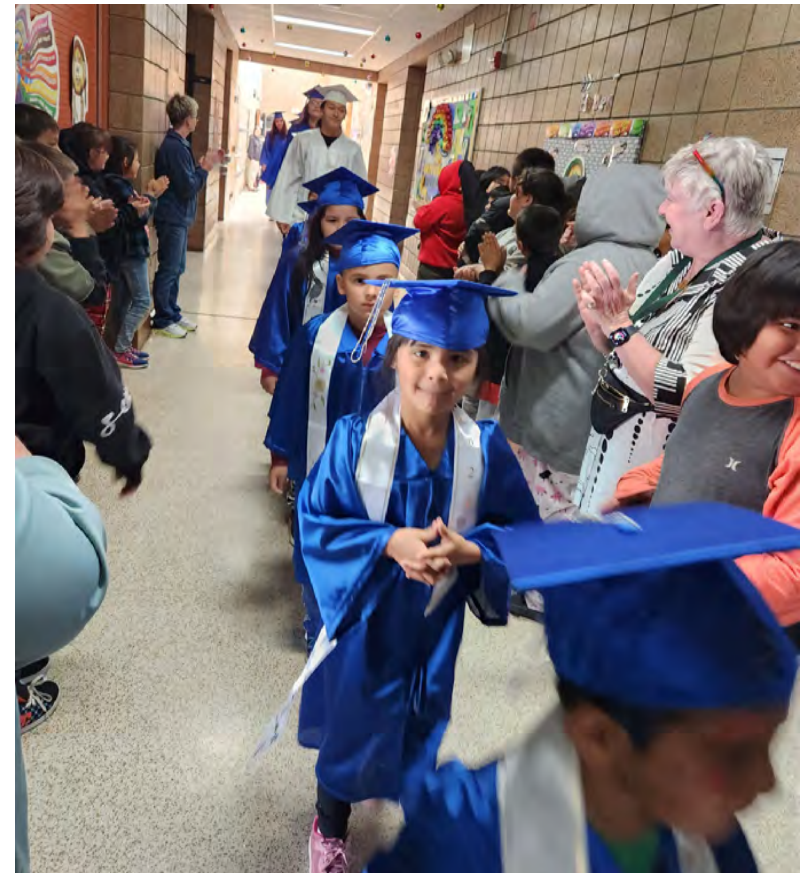
▲ The graduates from Bug O Nay Ge Shig, both Kindergarten and Seniors, celebrated with a walk through the halls to the cheers of students and staff!