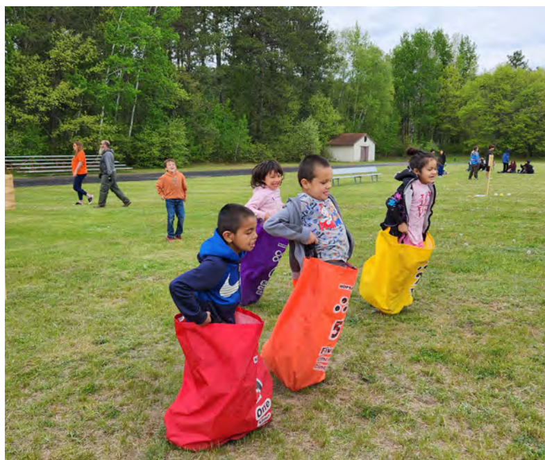
▲ K-6 th grade students at Bug O Nay Ge Shig enjoyed beautiful weather for Track and Field Day during the last week of school.