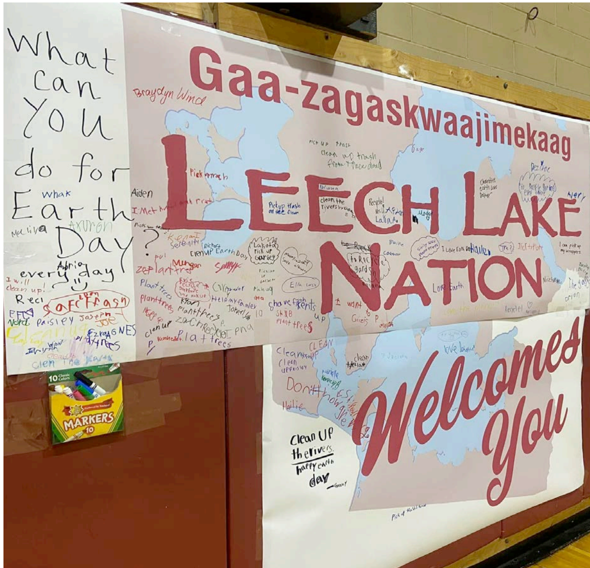
Students and attendees write Earth Day messages on what they can do for the earth on Earth Day.