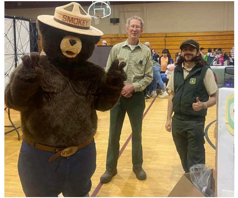
Smokey Bear was available for photos during the event.