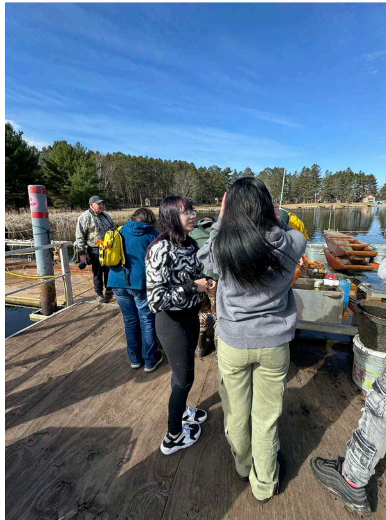
▲ The Seasonal Classes of Bug O Nay Ge Shig enjoyed a field trip to Cut Foot Sioux. The students learned about retaining and maintaining our natural resources such as the walleyes.