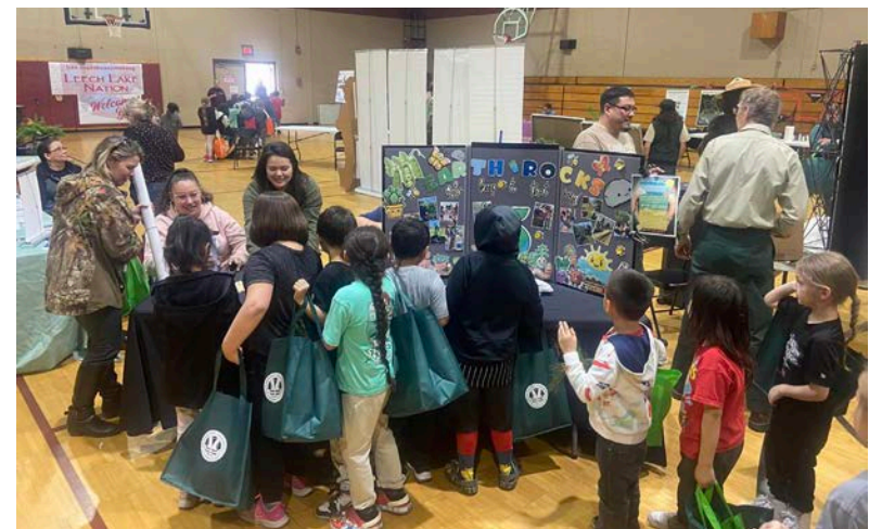
An assortment of informational booths and activities were made available to those who attended.