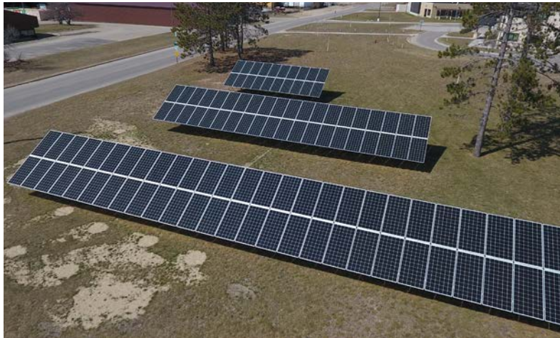
Solar panels that are currently outside of the LLBO Tribal Government Offices in Cass Lake, MN.