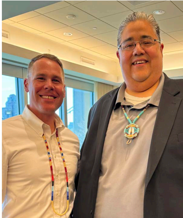
via SECRETARY TREASURER'S OFFICE

The Commission took this action despite the Minnesota Alcohol and Gambling Enforcement Director's clear opinion that HHR machines are illegal slot machines and cannot be approved by the