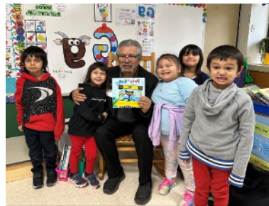
via CHAIRMAN'S OFFICE