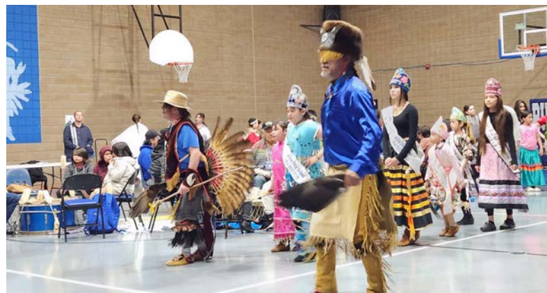
▲ Bug O Nay Ge Shig's Annual Elder Feast and Pow Wow was held in April with a large number of elders attending. Elders were honored with a feast and then presented with quilts, local crafts, food and other gifts.