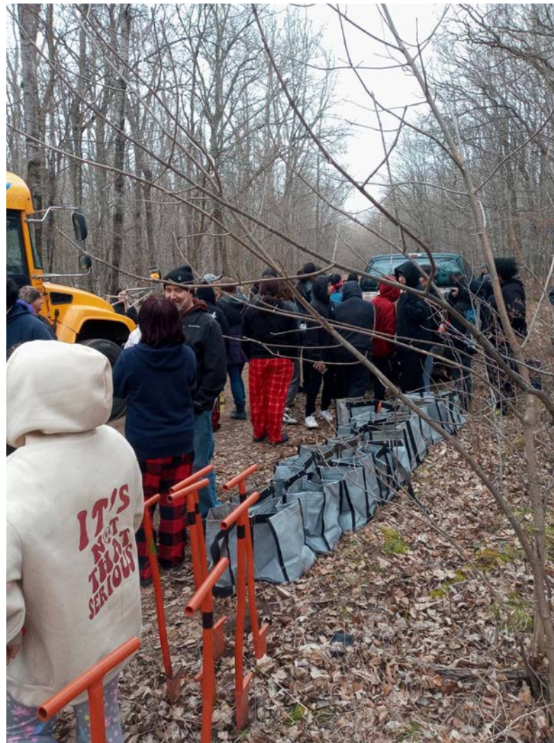
▲ A group of Bug O Nay Ge Shig students spent a morning planting cedar seedlings on Inger Point in coordination with a forestry crew. Over 370 seedlings were planted.

15353 Silver Eagle Drive, Bena, MN 56626 | Phone: 218-665-3000 Toll Free: 1-800-265-5576 | www.bugonaygeshig.org